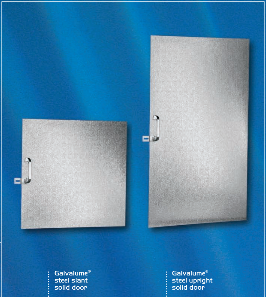
Galvalume® steel slant solid door