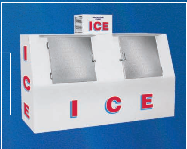
slant-75 Model # S75SS Capacity: 300 – 7lb bags Dimensions: 68" H x 96" W x 36" D Compressor: 1/2 HP, 115 V Door Size: 2 - 27" x 27"