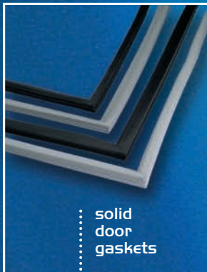
solid door gaskets

Custom made doors available for any ice merchandiser. Call for a quote.