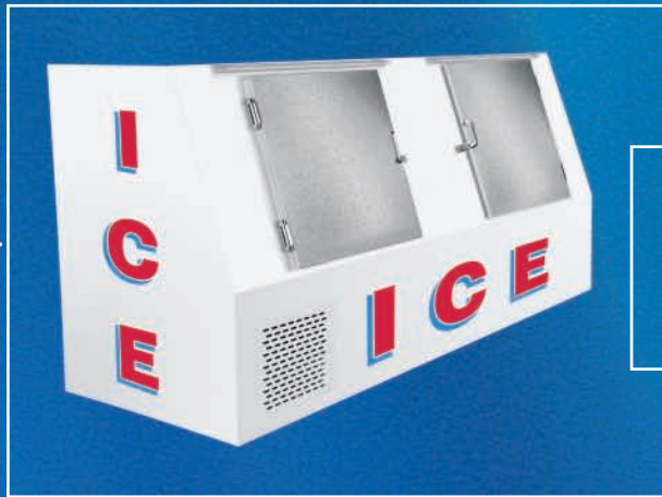
low profile slant-61 Model # S61SSLP Capacity: 240 – 7lb bags Dimensions: 48 1/4" H x 96 1/8" W x 35 7/8" D Compressor: 1/3 HP, 115 V Door Size: 2 - 27" x 27"