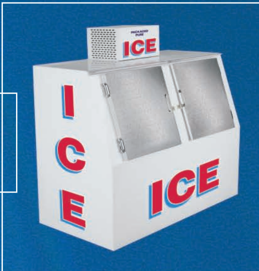
slant-61 Model # S61SS Capacity: 240 – 7lb bags Dimensions: 66 1/4" H x 72" W x 36" D Compressor: 1/3 HP, 115 V Door Size: 2 - 27" x 27"