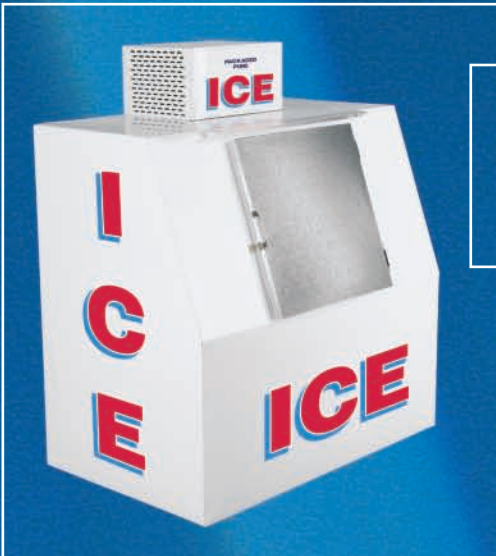
slant-45 Model # S45SS Capacity: 175 – 7lb bags Dimensions: 67 3/4" H x 58" W x 36" D Compressor: 1/3 HP, 115 V Door Size: 27" x 27"